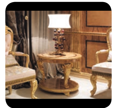
ART. GP. 645 ROUND COFFE TABLE CM 120 X H.50