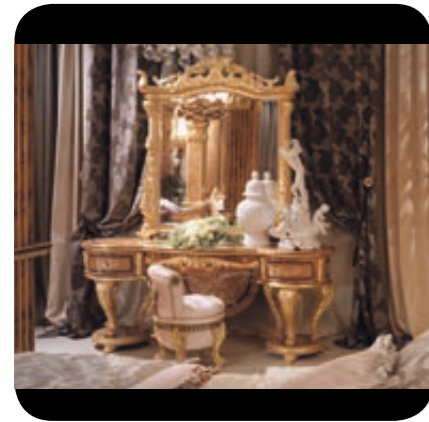
ART. GP. 220 TOILETTE CM 196 X 62 X H. 81