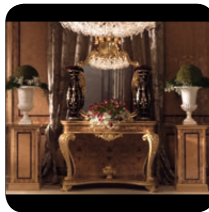
ART. GP. 370 MIRROR CM 110 X 8 X H.130