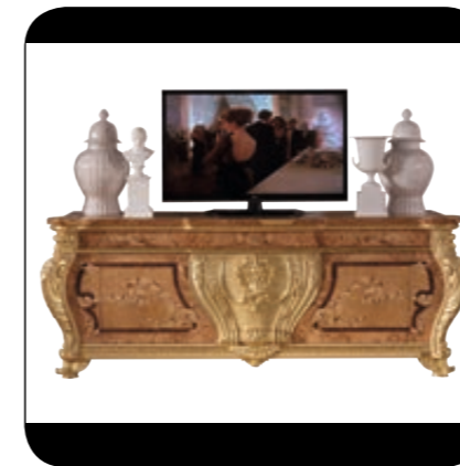
ART. GP. 170 2 DOORS TV-HOLDER CM 216 X 63 X H.82