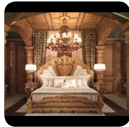
ART. GP. 200 SUPERKING BED CM 265 X H. 202 FOR CM 200 X 200 BEDDING