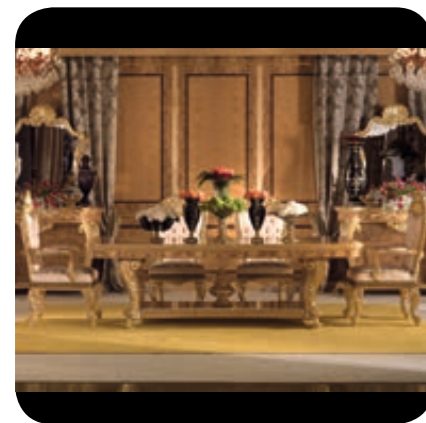
ART. GP. 130 RECTANGULAR TABLE CM 250 X 125 X H.78