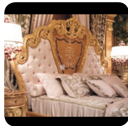
ART. GP. 270 DUVET BED COVER