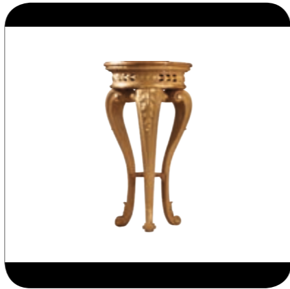
ART. GP. 650 TRIPOD TABLE ⊙ CM 64 X H. 115