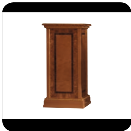
ART. GP. 660 PLINTH TABLE CM 50 X 50 X H. 101