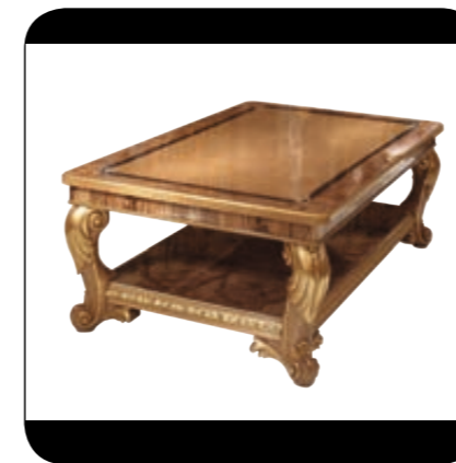
ART. GP. 630 RECTANGULAR COFFE TABLE CM 140 X 80 X H.46