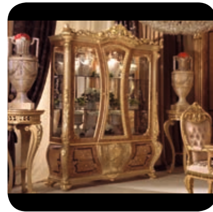
ART. GP. 100 2 DOORS GLASS CUPBOARD CM 197 X 57 X H.246