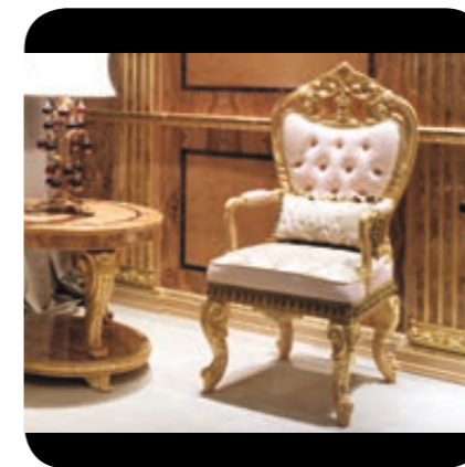
ART. GP. 390 SMALL ARMCHAIR CM 56 X 64 X H. 130